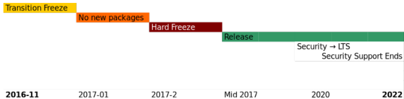
Figure 3: Stretch Release